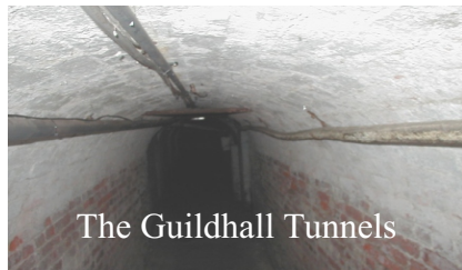
The Guildhall Tunnels

Starting at our meeting point, The Old Bell on Sadlergate. We start the walk with an introduction to the night as we head off to the Cornmarket, & Fishmarket areas of the city, where you will learn the infamous ghost story of PC Moss, the only police officer in Derbyshire to be murdered in the line of duty.